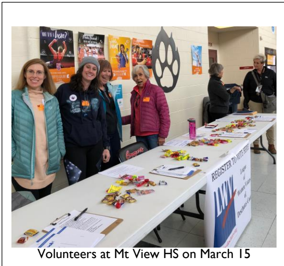
Volunteers at Mt View HS on March 15